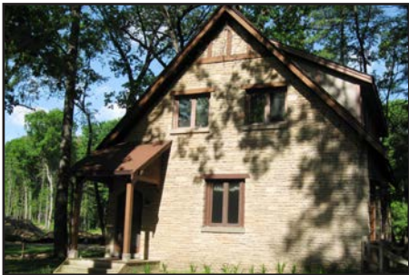
Christian Writing Center Apartment Cozy apartment behind the Christian Writing Center. One bedroom, one bath, kitchen and living area; Wi-Fi. Cap. 4 (2 queens)