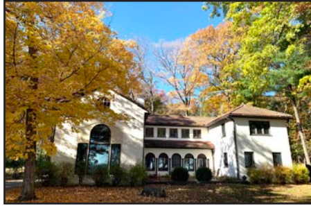
Delmar-Miller House Seven bedroom Mediterranean-style house with seven and one-half baths, Wi-Fi, large living room with a cathedral ceiling, Clavinova piano and gas fireplace. One room is handicap accessible. Cap. 18 (4 queens, 8 singles, 2 single sofa beds)