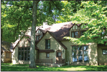
Christian Writing Center English stone manor house, eight bedrooms, six baths, Wi-Fi and gas fireplace. Cap. 20 (3 queens, 12 singles, 1 trundle bed)

Most of our beautiful lakefront houses have large living rooms which make great gathering places. All lakefront houses (except Oncken-Crum) have private piers to dock a boat or sit and enjoy Green Lake. Houses are equipped with linens, cooking and dining equipment, a charcoal grill and are air conditioned. Two night minimum stay required.