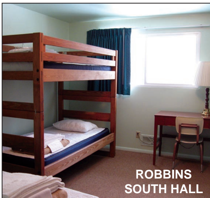
ROBBINS SOUTH HALL