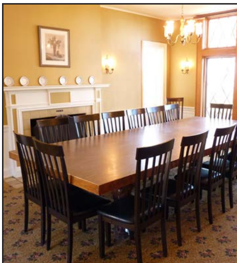
Christian Writing Center dining room