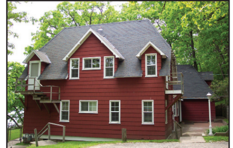
Robbins Memorial House* Seven bedrooms, four baths. Spectacular living room with cathedral beamed ceiling and wood burning fireplace, three-season room. Cap. 14 (3 queens, 8 singles)