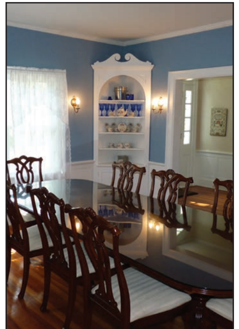
White House dining room