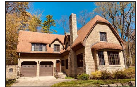
Stambaugh House* Charming two-story English-style stone house with four bedrooms, two and one-half baths and a sunken living room with Clavinova piano, gas fireplace and wonderful lake views. Cap. 12 (1 queen, 8 singles, 2 single sofa beds)