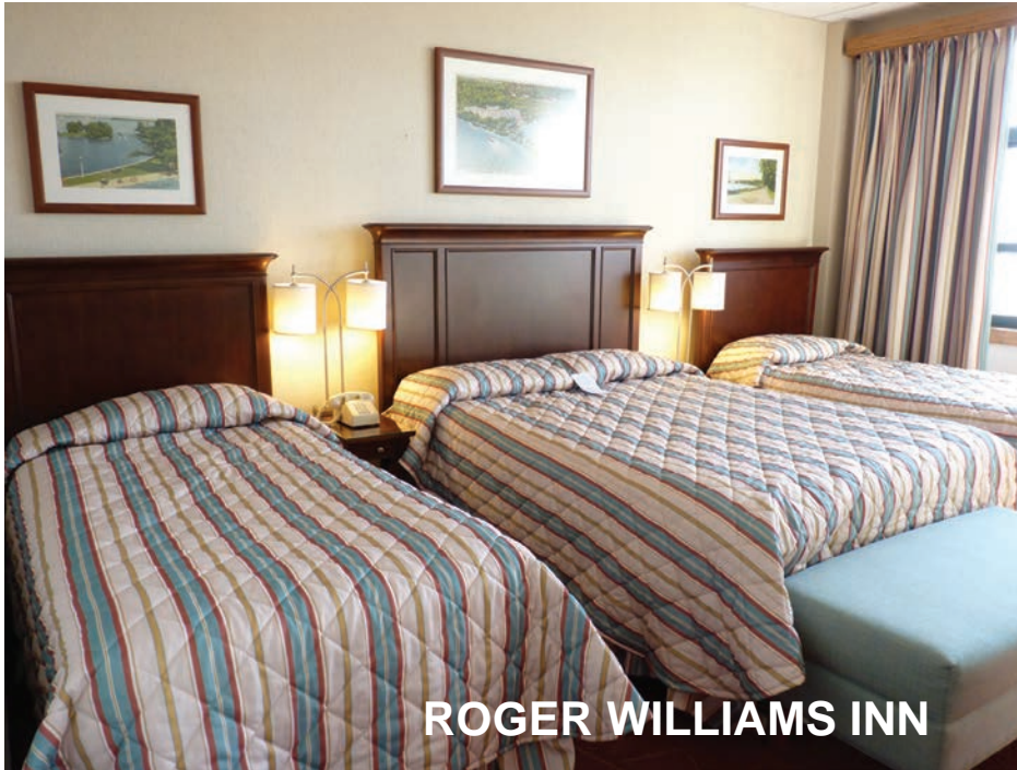
ROGER WILLIAMS INN

ROGER WILLIAMS INN was built in 1930 and has 65 rooms, most with a lake view, which accommodate 1 to 4 people each. This historic hotel has a lobby with floor-to-ceiling windows with a lake view. The Penthouse, located on the 5th floor, has spectacular lake views and accommodates 9 people in three rooms. Three meeting rooms are located off the 1st floor lobby.