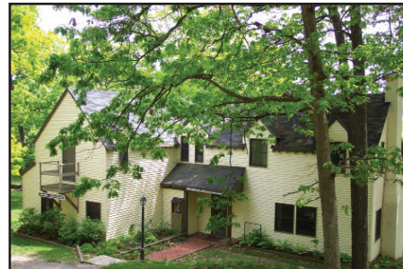
Oncken-Crum House* Beautifully decorated in a nautical theme, this lakefront house has five bedrooms, four and one-half baths, three-season room and gas fireplace. Cap. 14 (2 queens, 10 singles)